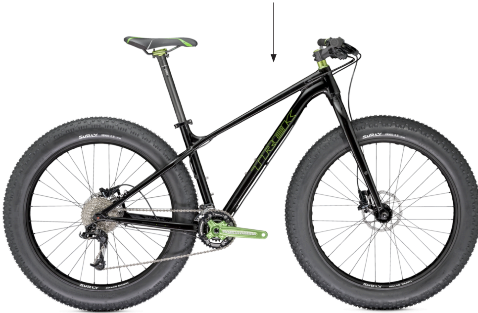
2014 Farley (also available in Blue)

"FARLEY" is printed on the top tube of the frame