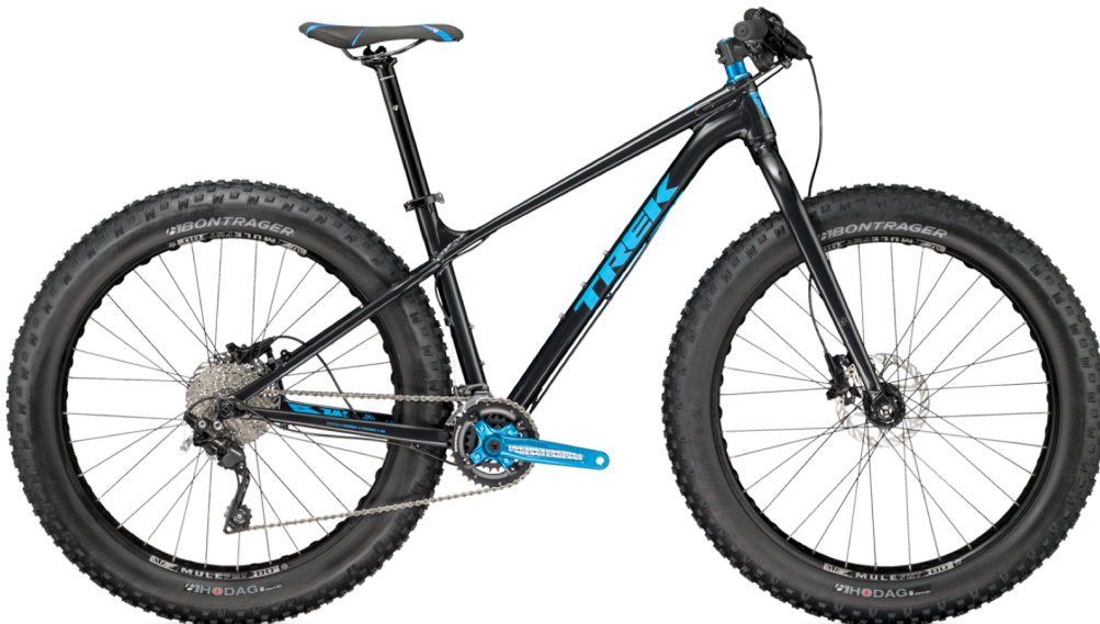
2015 Farley 6