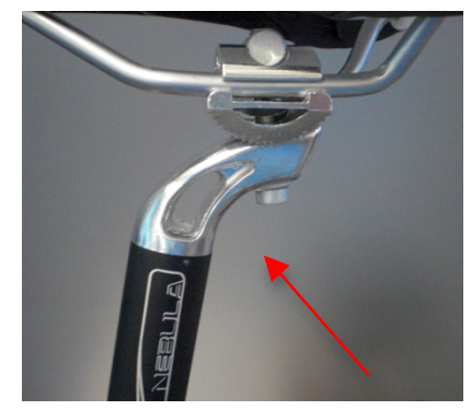
Figure 1. Nebula seatpost showing saddle clamp bolt

This letter contains important information regarding what to do next if you think you may have purchased one of these bicycles.