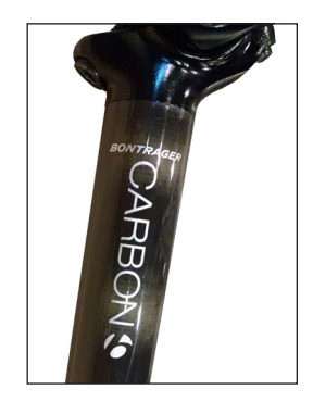
FIGURE 2. Bontrager Approved Carbon seatpost

If the seatpost breaks unexpectedly, you could be involved in a serious accident. Do not ride the bicycle until your local Trek retailer has inspected the seatpost to determine if it is affected by this recall.