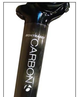
FIGURE 2. Bontrager Approved Carbon seatpost