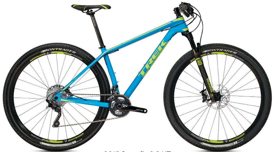
2015 Superfly 9.8 XT