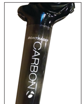
FIGURE 2. Bontrager Approved Carbon seatpost