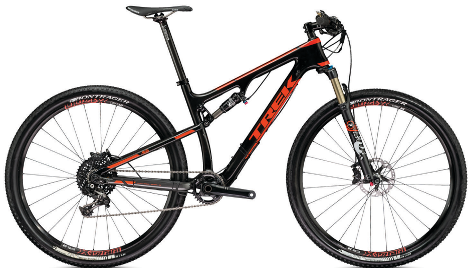
2015 Superfly 9.8 FS SL