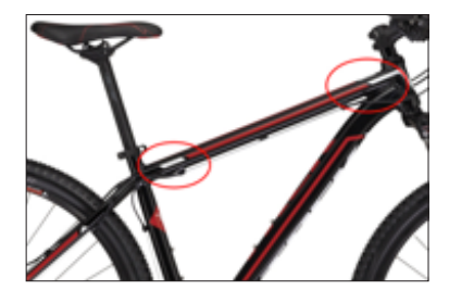
Figure 2. Location of the model name.

The model name is written on the frame, usually at one end of the top tube (figure 2).