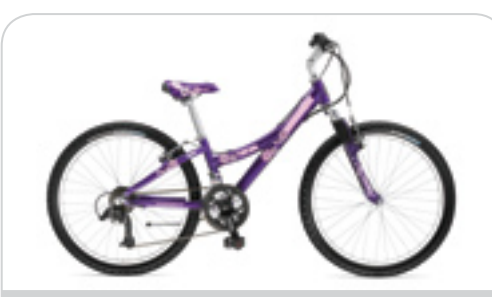
FIGURE 6 | Metallic Purple