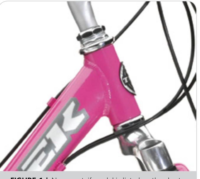
FIGURE 1 | No gusset; if model is listed on the chart to the left, the bicycle is recalled.