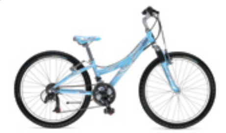
FIGURE 3 | Light Metallic Blue