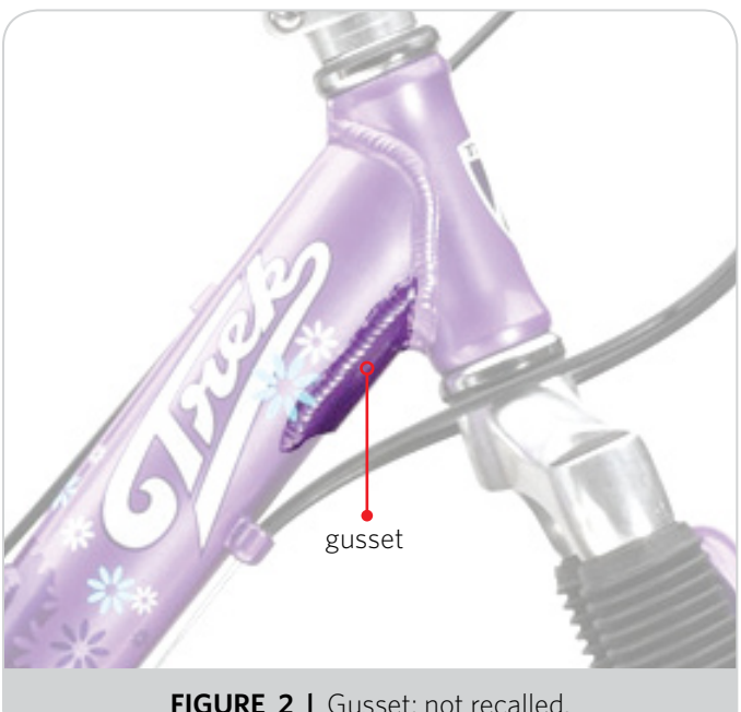
FIGURE 2 | Gusset; not recalled.