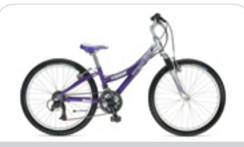
FIGURE 4 | Met. Silver/Met. Purple